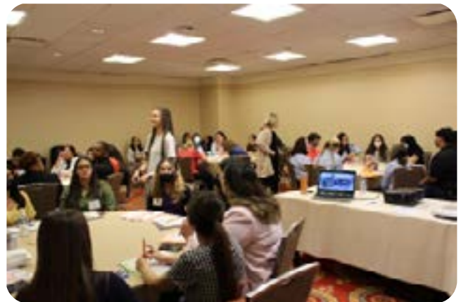
Paris HS wowing students with their breakout session at the 38th Teach Tomorrow Summit.