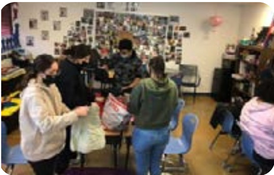
Service Project: NYOS Charter School is making bags of uniforms in need at their feeder elementary school.

TAFE chapters, please remember that I would love to see any of the TRAFLES your chapter participates in throughout this year! Feel free to share any TRAFLES memories or moments with me at: mkj919@icloud.com