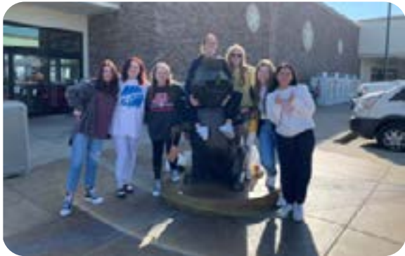
Kingwood HS enjoying a pitstop at Buc-ee's on the way to the 38th Teach Tomorrow Summit.