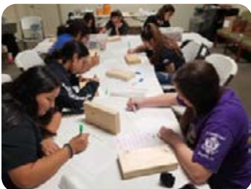
Leadership: Lockhart HS growing and sharing their leadership skills with the junior high officer team.