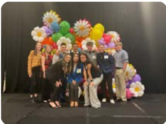
Veribest HS TAFE Chapter enjoying the opening session.