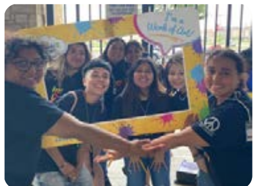
Recreation: Lockhart HS out at the Dell Diamond's Education with Express event!