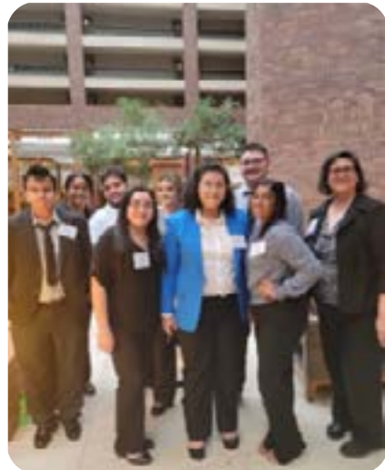
Moody HS stops after check-in to pose for a photo.