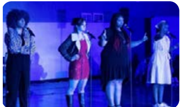
Educational Awareness: NYOS Charter School at their school's Black History Month Program