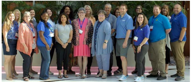
▲ Educators Rising State and Regional Coordinators