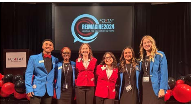
▲ Networking with FCCLA Officers